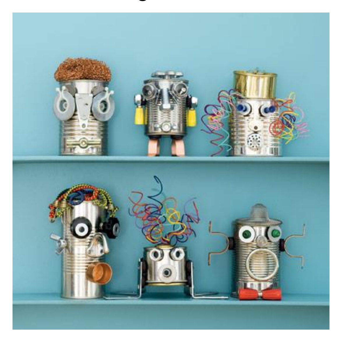
Tuesdays at 6:30PM in the Fellowship Hall

Come help make crafts to sell at Emanuel's Fall Bazaar table.