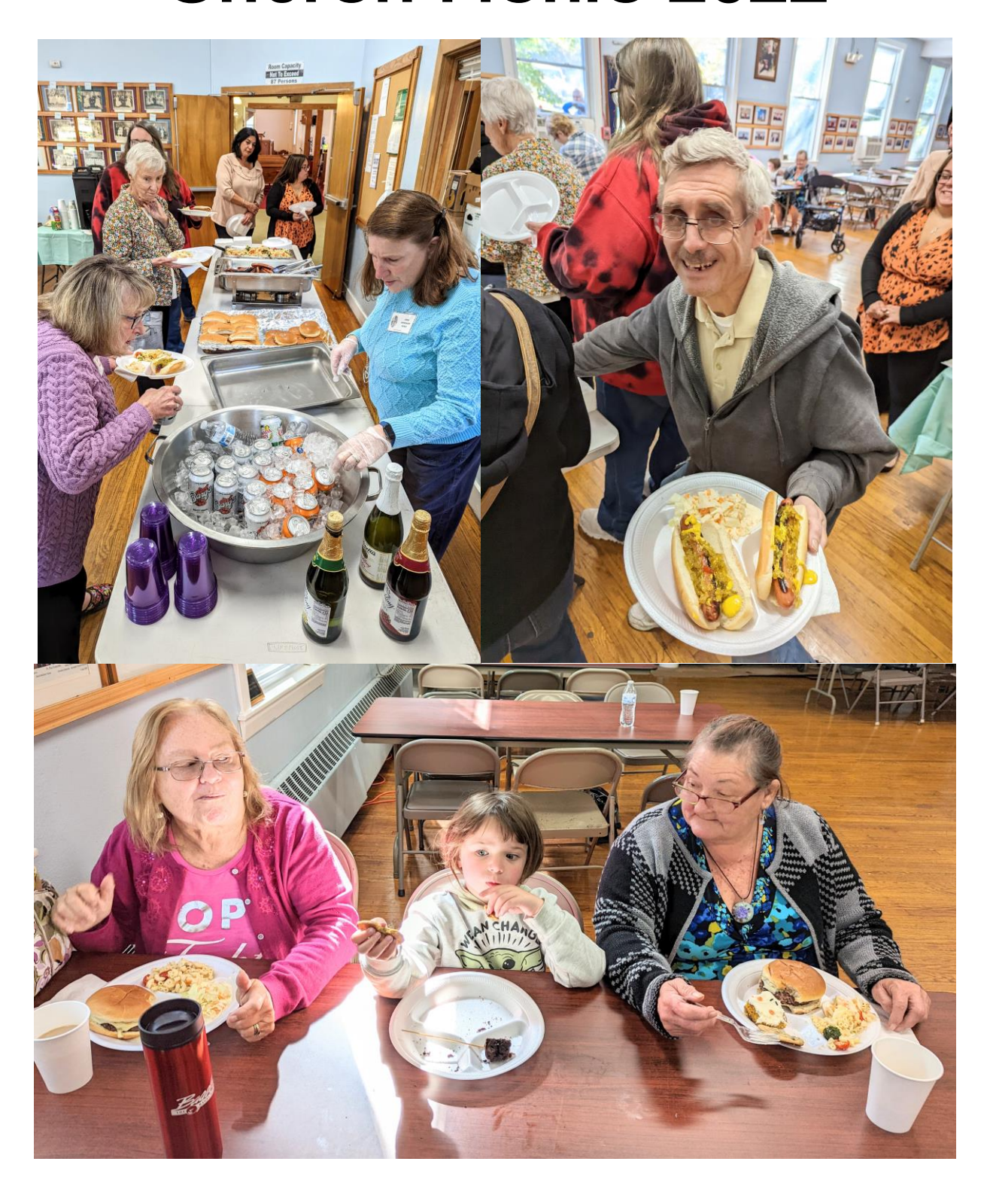
Lots of fun and good food.